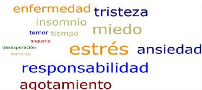
Graphic 1. Cloud of words associated to the meaning of the cancer of suckles non metastatic

They were associate 27 words that emerged in 123 occasions, which configure three indicators of subjective content that mention to psychological clinical symptoms, states of spirit and experiences of psychological uneasiness, as well as resources confrontation psychosocial and protection measures (Graphic 1).